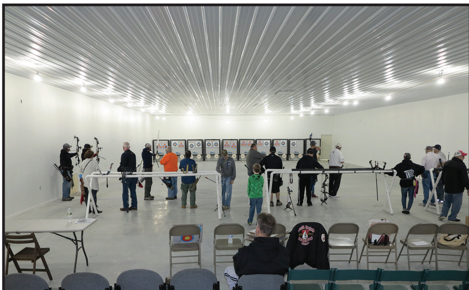
Inside the NJ Archery Center